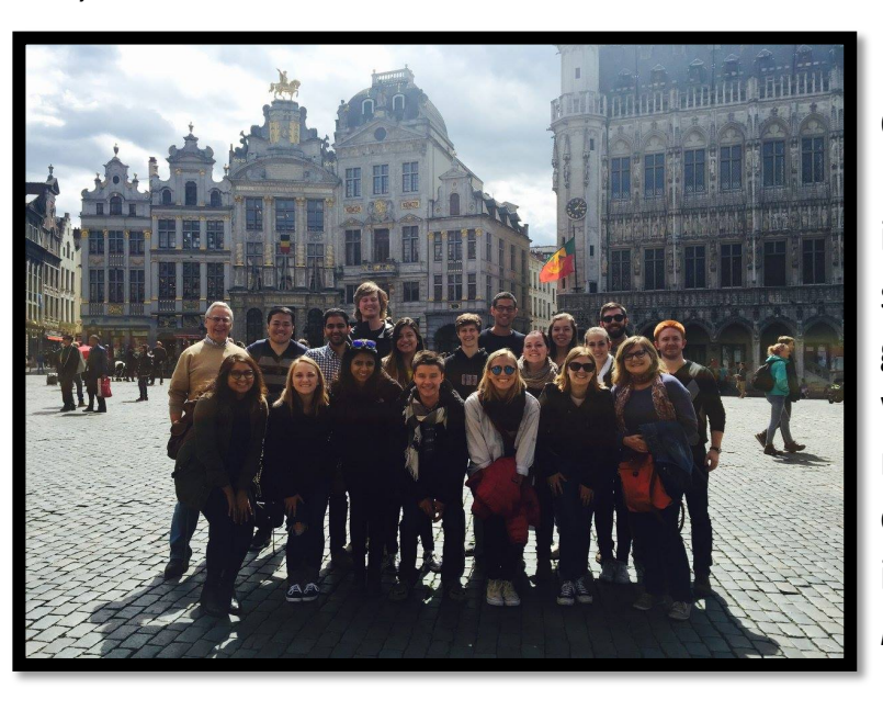
Georgia Tech Lorraine Campus in Metz, France